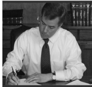
Governor Matt Blunt

Our Republican elected officials are working hard for you, ensuring that Missouri continues to move forward in a positive direction. We thank you for your support and encourage you to visit their websites and learn more about their historic accomplishments.